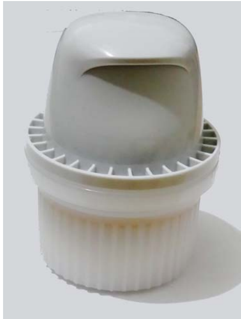
Figure 4. Sensor applicator as received

The sensor applicator (hereinafter generally just "applicator") contains the complete sensor, ready to be emplaced, but so far inactive. We see it, as received by the patient, in Figure 4.