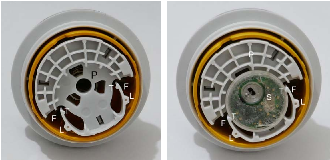
Figure 6. Spring fingers

But we can see the spring finger arrangement in the left hand image of Figure 6. which shows the sensor supporting platform, on a “spent” applicator, with the orange cylinder fully pressed back into the applicator, as it would be after the sensor is emplaced.