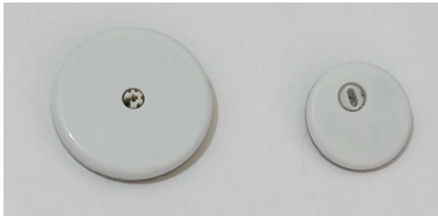
Figure 10. FreeStyle Libre 14 day Flash CGM system sensor (left), FreeStyle Libre 3+ CGM system sensor (right)

The 3+ sensor (to use a short name for the newer system) is much smaller and lighter than the 14 day system sensor. We see the two sensors compared in Figure 10.