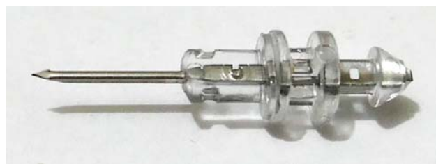
Figure 3. Introducer needle and hub

It is initially surrounded by a small "U" cross-section metal channel with a sharp pointed end, the introducer needle (not present in Figure 2). This will enable the probe to be pushed into the patient's flesh, which we could not do with the probe itself (it being "limp as a noodle"). We see it in Figure 3.