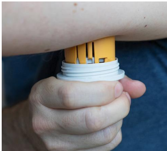
Figure 8. Applying the sensor

We see the start of this operation in Figure 8.