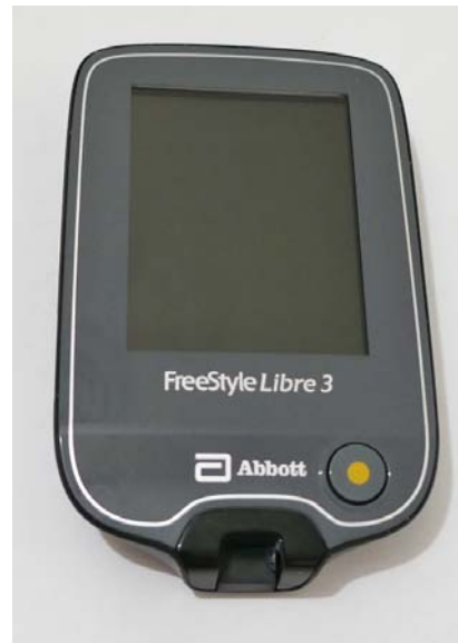
Figure 9. Reader