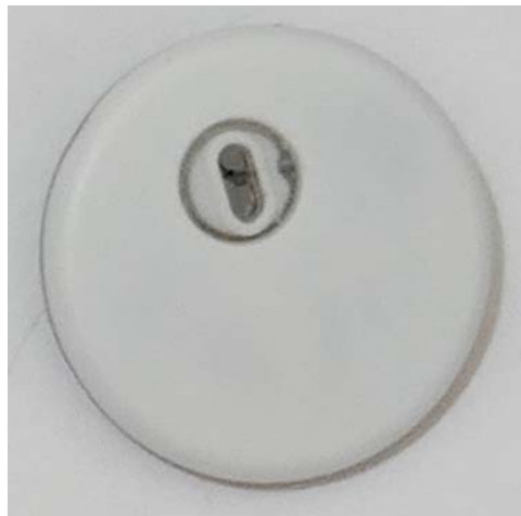
Figure 1. FreeStyle Libre 3+ sensor as installed, from the back

Figure 1 shows the FreeStyle Libre 3+ sensor from the “back” as it would appear when in place on the patient’s skin.