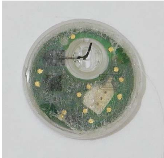
Figure 2. Sensor as installed, from the front

Figure 2 shows the sensor as it would be when emplaced (but here not emplaced), seen from the front, the side that would actually be against the skin of the patient's arm, then held in place with a circular disk of double sided tape with a very tenacious adhesive (not present in this photo).