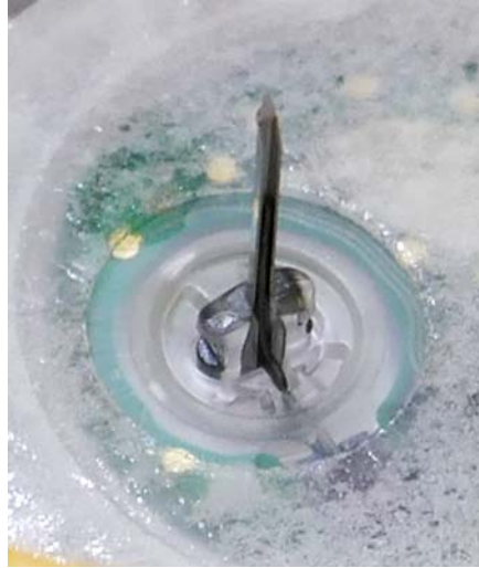
Figure 7. Probe in introducer needle

Again, as seen in the lower portion of Figure 5, the detector probe (surrounded by the introducer needle) projects from the underside of the sensor through a hole in the tape disk. We see this close-up in Figure 7.