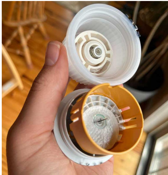
Figure 5. Applicator proper (bottom) and applicator cap (top)

Underneath the cap, now projecting from the applicator proper, is an orange cylinder, which is the business end of the applicator. It will later be driven back into the applicator when we press the applicator toward the skin, but there is a detent arrangement that initially resists such movement, mainly to prevent the cylinder from being driven back into the applicator by shock forces encountered during shipment.